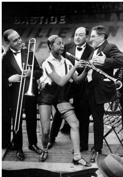
From top; Sidney Bechet, 1935; Caveau des Legendes jazz club; Josephine Baker, 1926

IT MAY BE more famous for its architecture and art, but no trip to Paris is complete without taking in some jazz. Options range from the once smoky and still-crowded clubs of St-Michel and St-Germain-des-Prés in the Latin Quarter to the more sophisticated establishments of Rue des Lombards in the 1st arrondissement. For something a little more spontaneous, jazz lovers seek out one of the many bars and brasseries in the 20th.